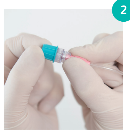
Apply the cap to the needle-free luer connector by pushing and twisting.