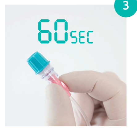
The BD PureHub disinfecting cap must remain on the needle-free luer connector for a minimum of one (1) minute and may remain on for up to seven (7) days.